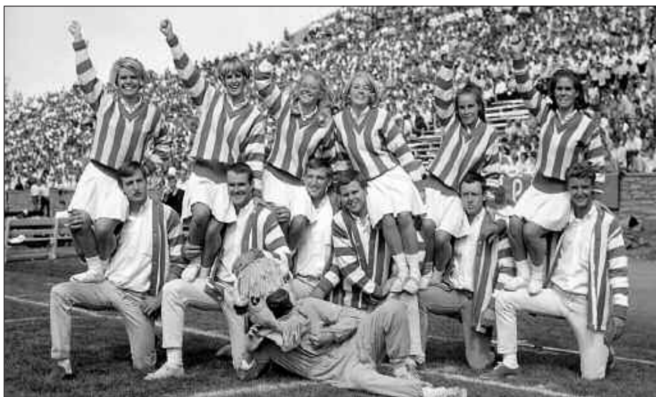
CU's cheerleaders pose with the then-costumed mascot in the 1966 opener against Miami, Fla.